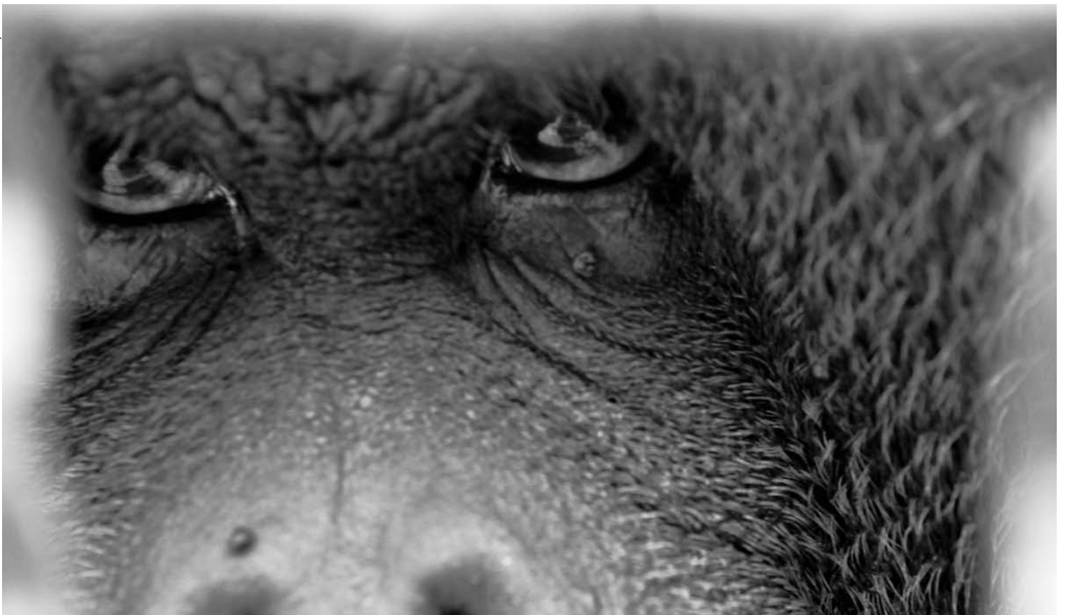
Linus, an orangutan at Center for Great Apes, Florida

pain on small numbers of animals in laboratory testing in order to provide benefits for many humans. (Here Kantian views about humans offer a good corrective, insisting that even the well-being of society as a whole does not justify egregious harms and indignities to any individual.)