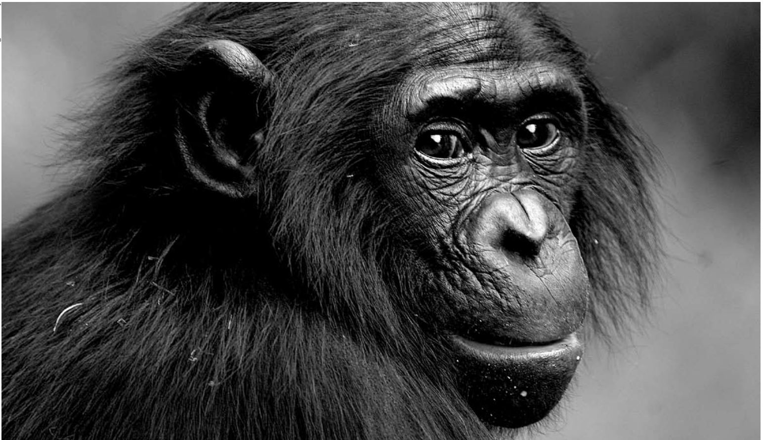
A bonobo at Lola ya Bonobo sanctuary, Democratic Republic of Congo